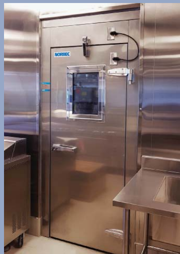
Steel hinged flush door in stainless steel