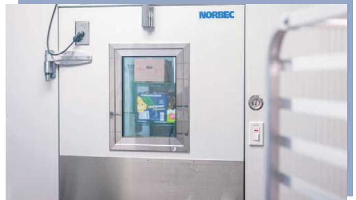
Door with integrated window