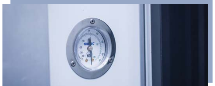
Analog thermometer integrated in the frame