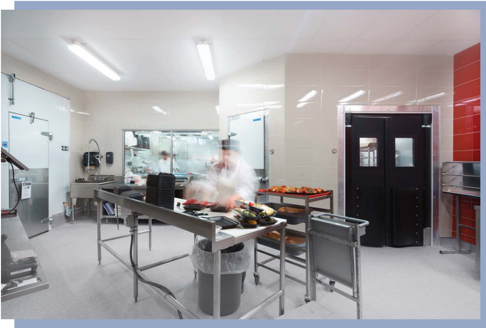
Two supermarket hinged doors with an aluminium door frame accompanied by a set of swinging doors.

FLEXIBILITY: multiple configurations are available: refrigerators, freezers, combos, refrigerated or dry storage. Solutions tailored to your needs that will allow you to maximize your space.