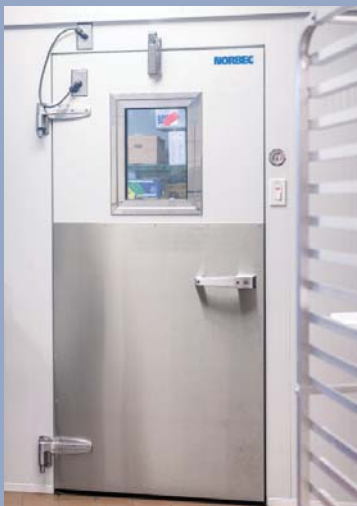
Steel hinged flush door in white finish

A thermal break is incorporated to the doors to limit the transfer of temperature causing condensation and the formation of ice. The design of the frame integrated in the panel provides an aesthetic finish and allows for a simple and effective cleaning, while the reinforcements guarantee a better resistance and durability. Moreover, a groove provided for the heating wire makes it more accessible when in need of replacement.