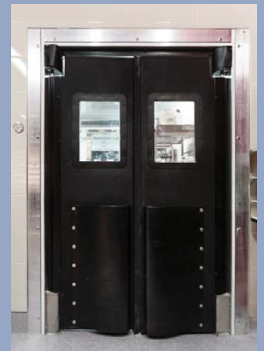
Swinging doors in black